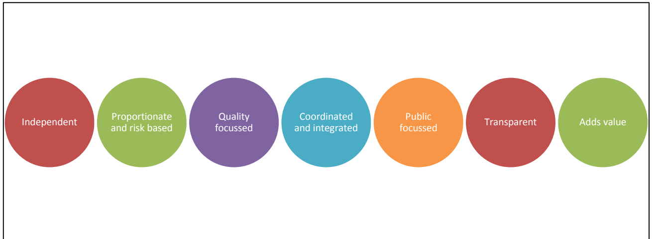
Exhibit 4 - General principles